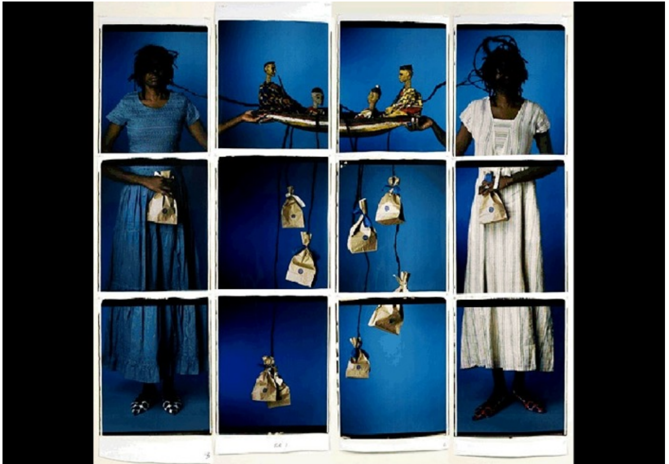
María Magdalena Campos-Pons - De Las Dos Aguas, 2007 - 12 Polaroid Polacolor Pro, 20 X 24 in.