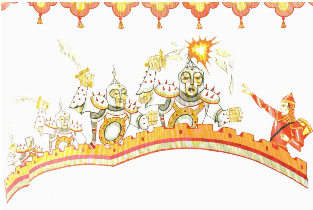
Fig. 67. The Prince and the Mechanical Watchmen

Source: Tarnowska, Wafa, Nilesh Mistry, and Ganjavī Nizāmī. The Seven Wise Princesses: A Medieval Persian Epic . New York, NY: Barefoot Books, 2000. Print.