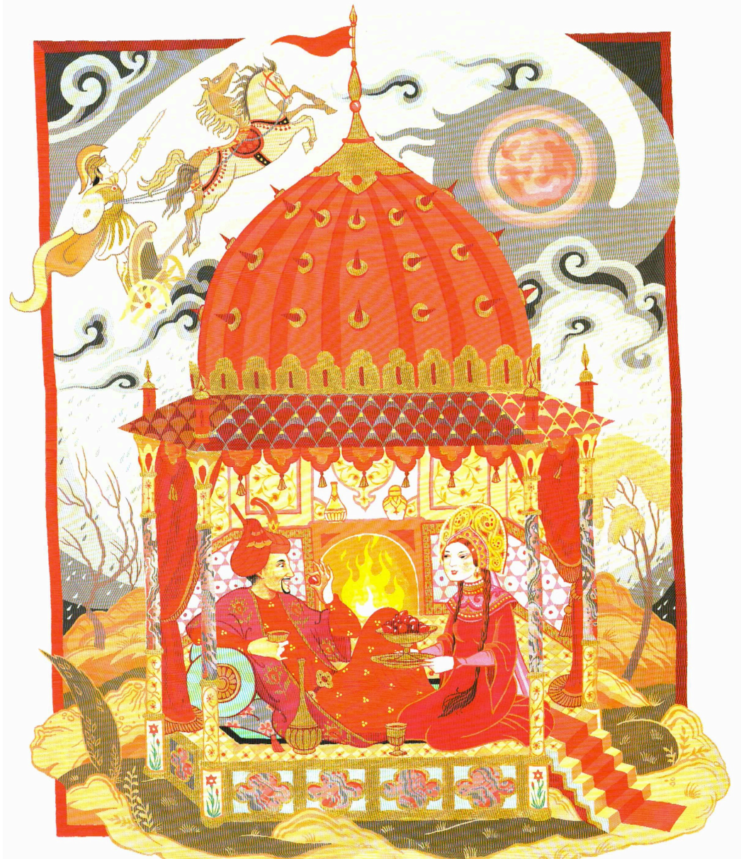
Fig. 64. Bahram Gur in the Red Pavilion

Source: Tarnowska, Wafa, Nilesh Mistry, and Ganjavī Nizāmī. The Seven Wise Princesses: