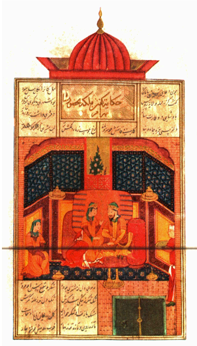
Fig. 63. Bahram Gur in the Red Pavilion

Source: Nizāmī, Ganjavī. The Story of the Seven Princesses . Oxford: Cassirer, 1976. Print.