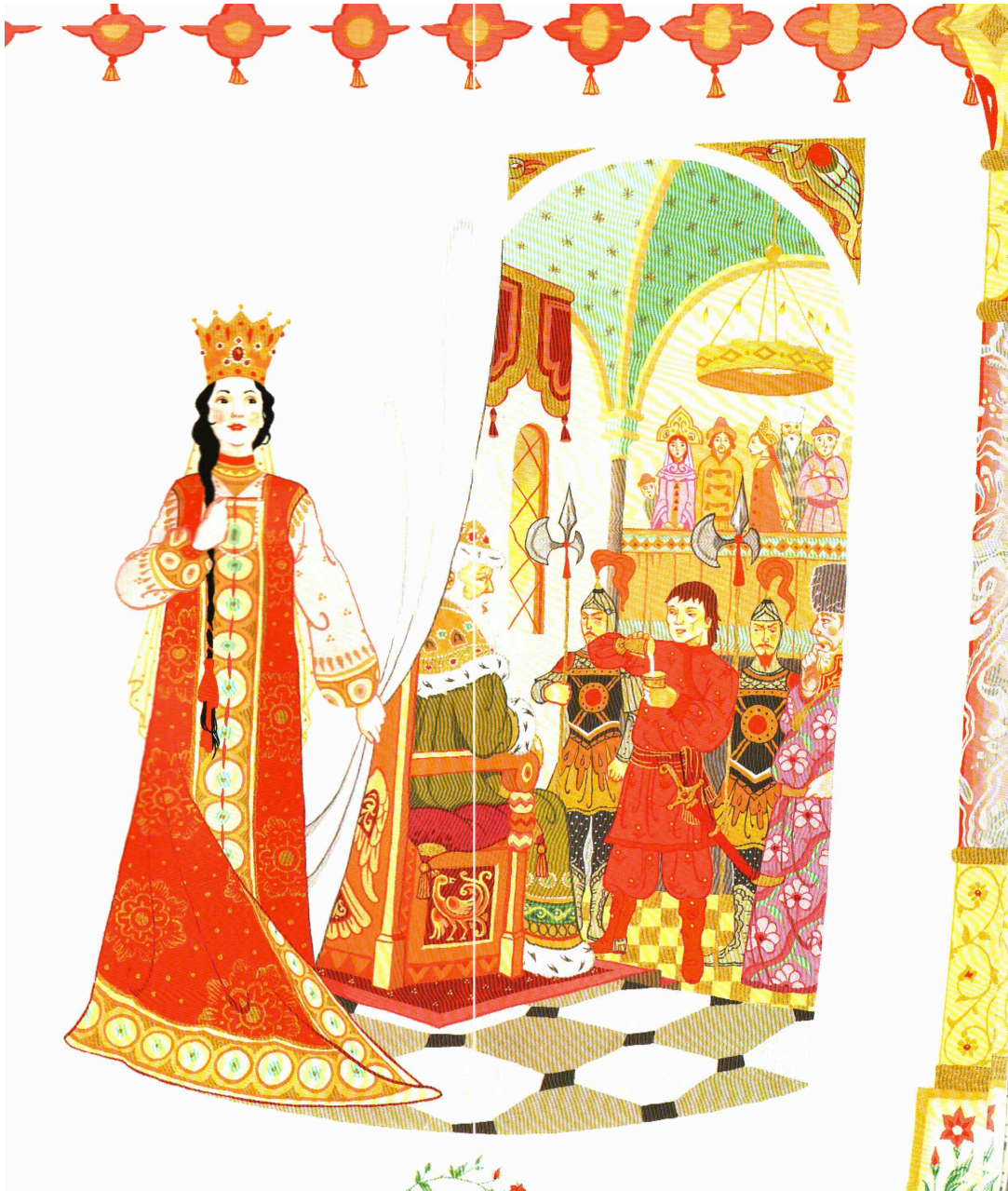
Fig. 68. Turandot