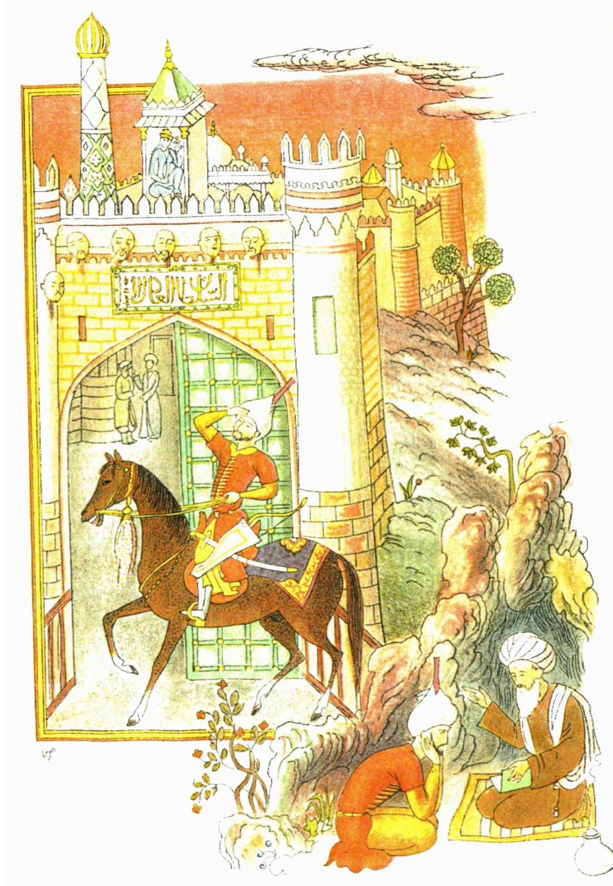
Fig. 66. The Prince

Source: Tarnowska, Wafa, Nilesh Mistry, and Ganjavī Nizāmī. The Seven Wise Princesses: A Medieval Persian Epic . New York, NY: Barefoot Books, 2000. Print.