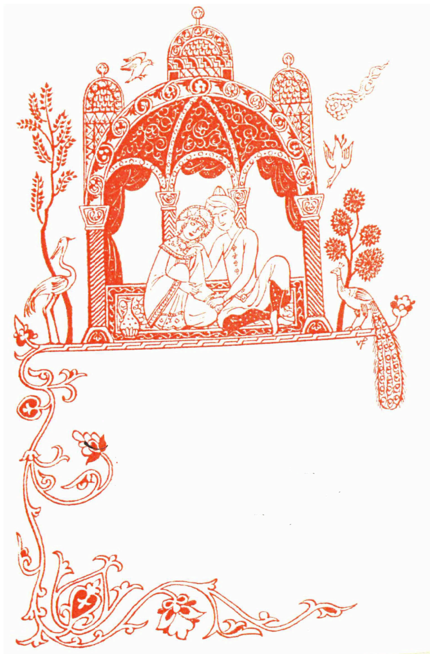
Fig. 65. King Bahram in the Red Pavillion.